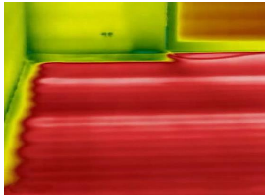
50mm Gyvlon Screed